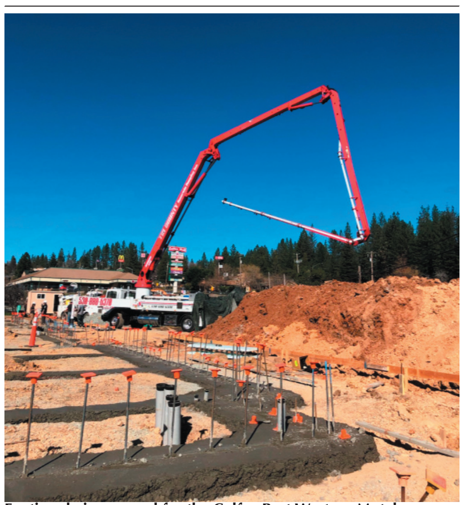
Footings being poured for the Colfax Best Western Motel.