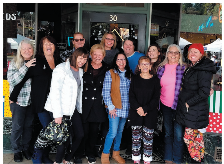
The Colfax Bunco Babes.

Three days before Christmas, a family didn't have the means to buy presents for their three chil-