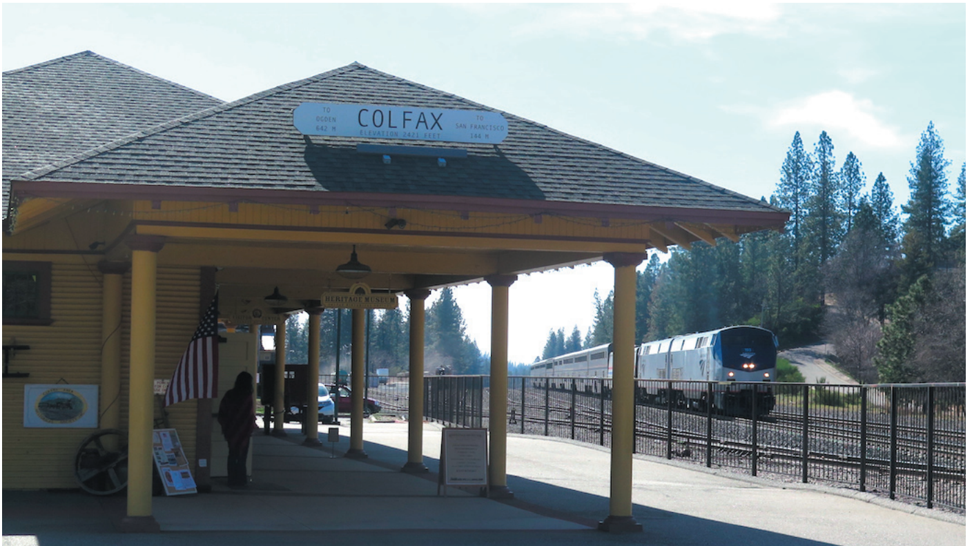
The California Zephyr arriving in Colfax.