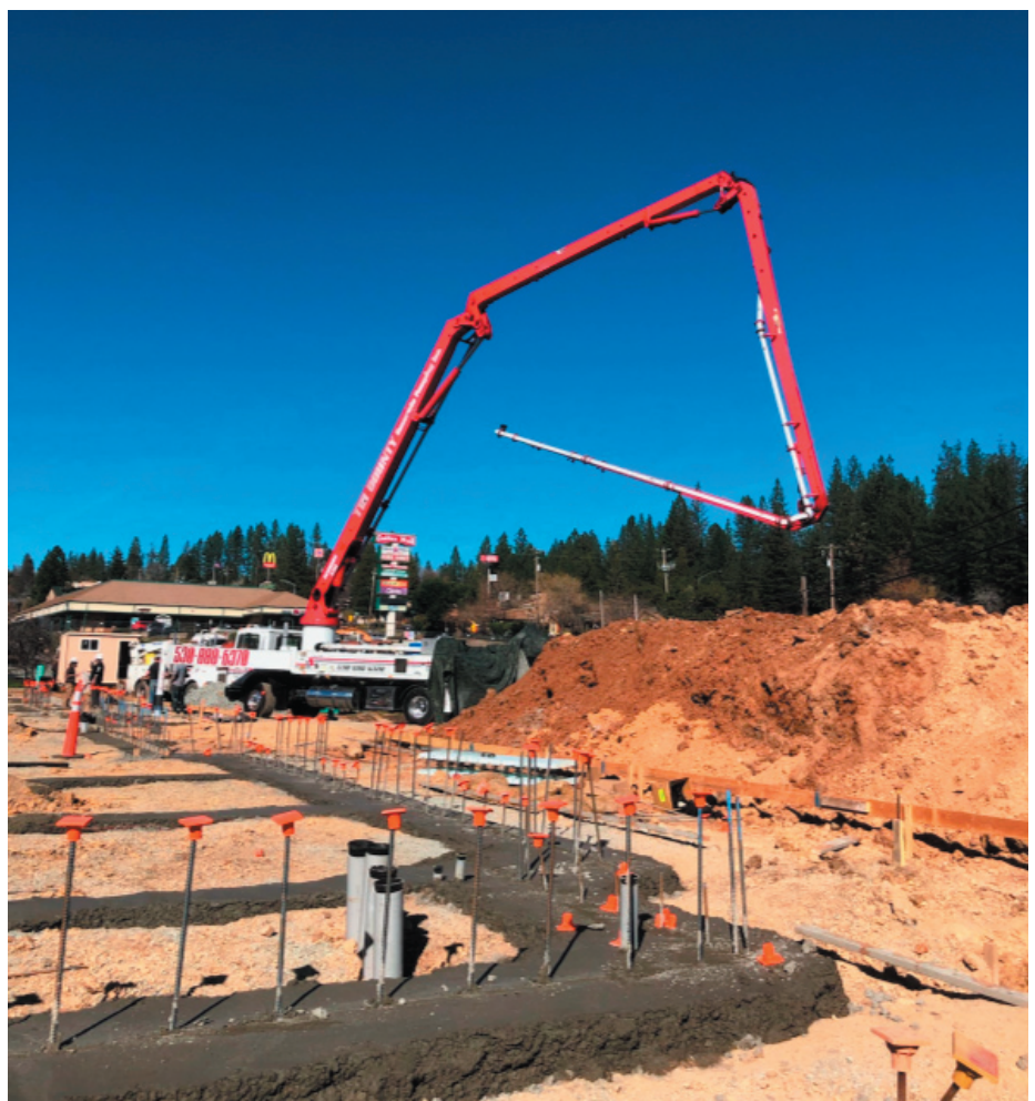
Footings being poured for the Colfax Best Western Motel.