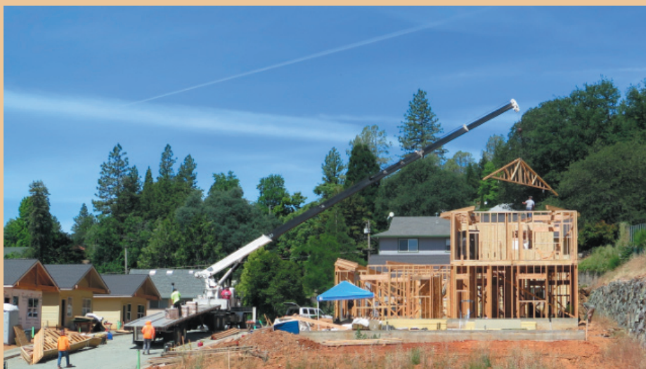
Roof trusses being lowered into place on Shadow Wood new houses in early June.

Remember: Please contact me if you know of or if you have a new business or an existing business doing something new: lindalouhaines14@gmail.com .