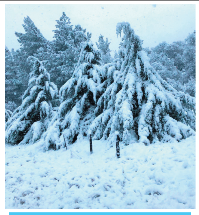
Snow In Colfax, Jan. 25, 2021