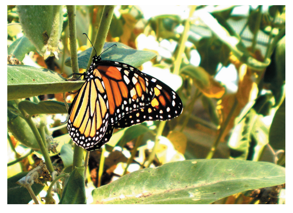
Monarch butterfly on milkweed at Downtown Farm in Colfax.

The steep decline in Monarch population numbers is attributed to continued loss of the butterfly's milkweed breeding habitat to agriculture and urban development, as well as the accelerating climate change that is producing larger and more de-