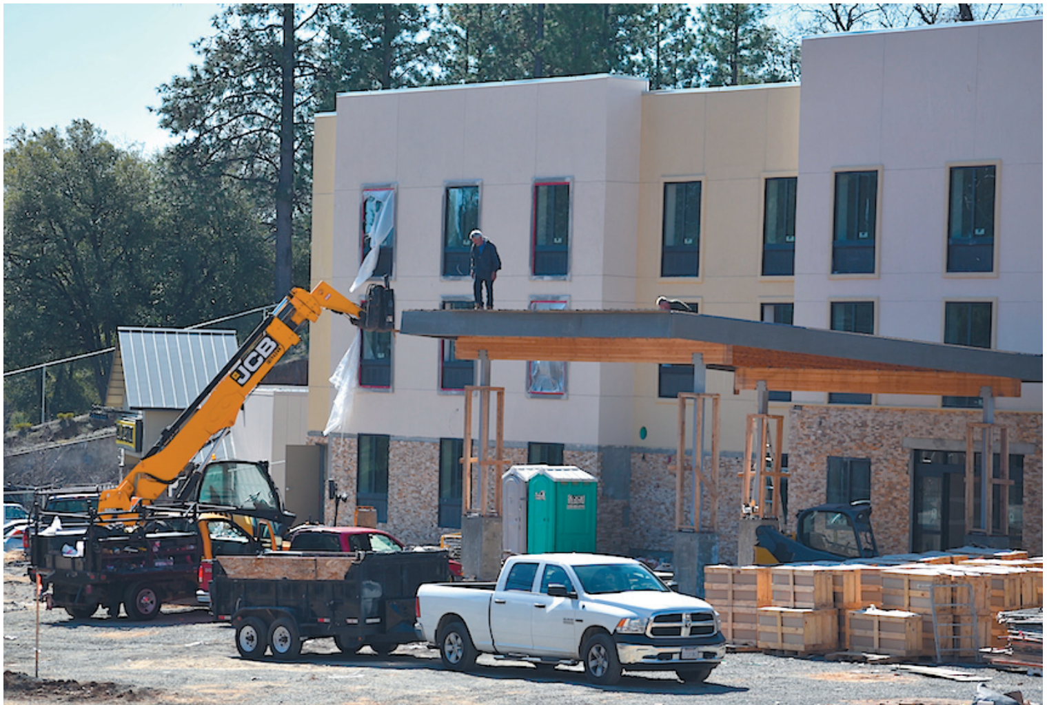
The Best Western project is shown getting a new entry cover. Construction on the project is scheduled to finish later this summer.