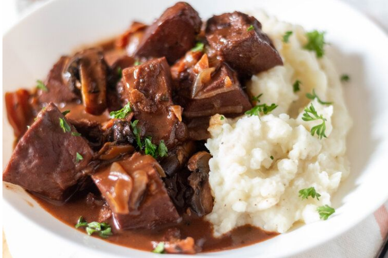
11-18-2021 American legion post 192 colfax