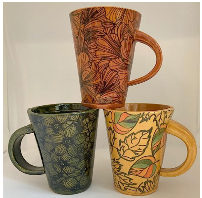
Above - Connie Simpson of Meadow Vista (ceramic mugs)