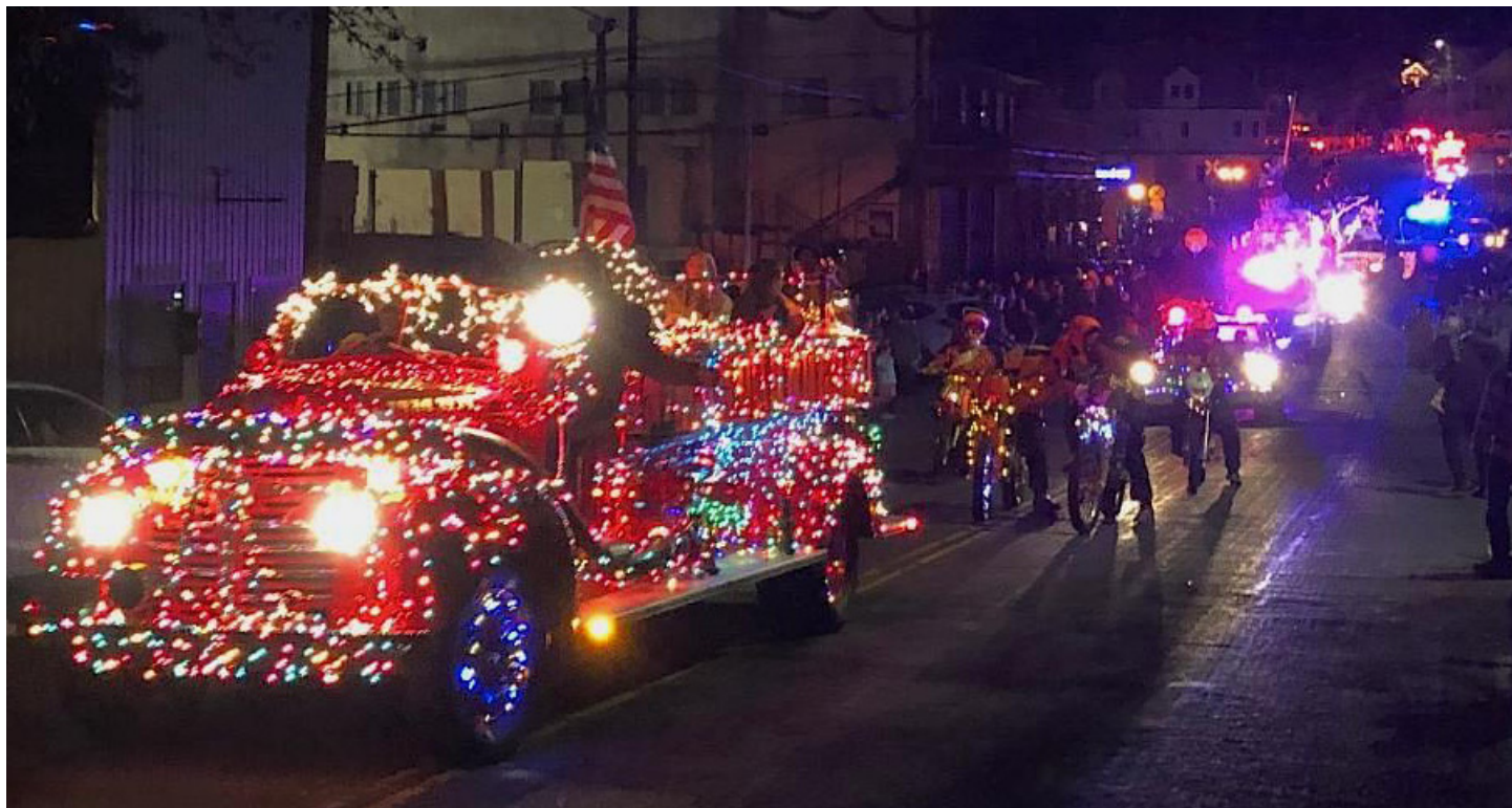
Above – Antique firetruck in parade of lights.