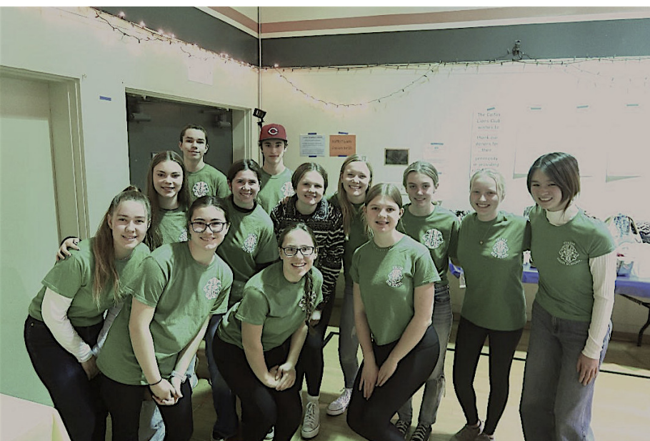
Leos table servers