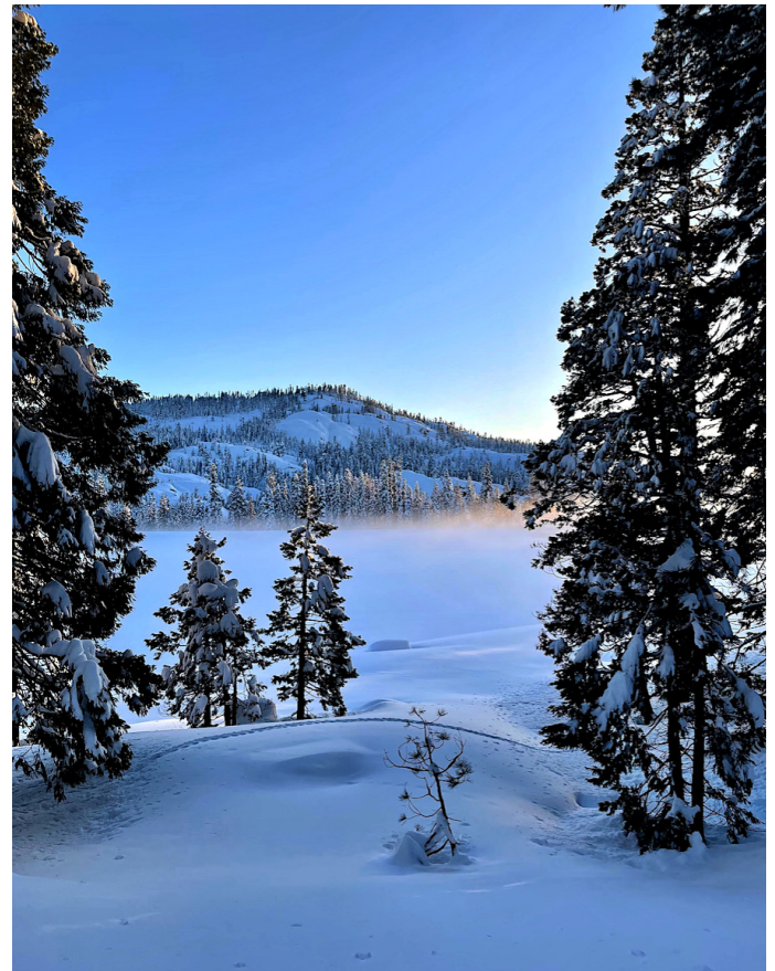
Lake Valley snow.

The onslaught of atmospheric rivers has been good for reservoir capacity. Lake Shasta (Sacramento River) is at 53%, Lake Oroville (Feather River) 59%, Bullards Bar (Yuba River) 80%, Folsom Lake (American River ) 55%, and Don Pedro (Tuolumne River) 76%. And as of January 19, 2023 the statewide average snowpack was 245% of normal for this time of the year.