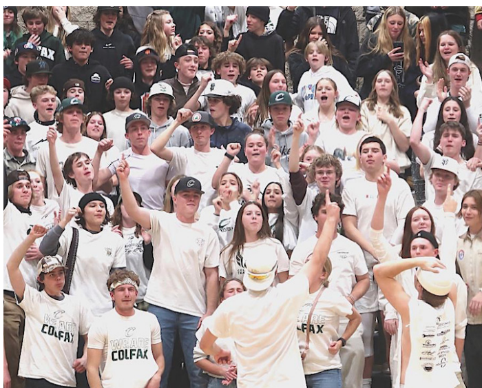
Above – The Colfax Spirit Squad was loud and lively cheering the Colfax Girls to a Nor Cal Finals victory.