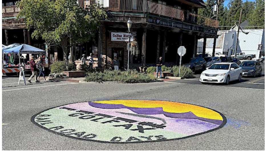
Above right -The traditional street painting.