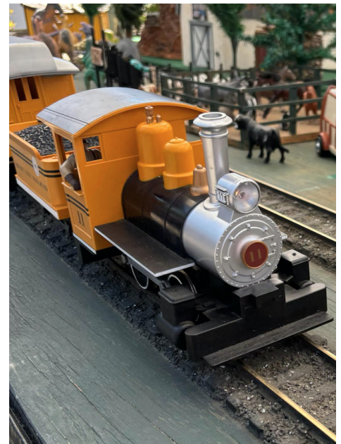
Model train from Diablo Pacific Line.