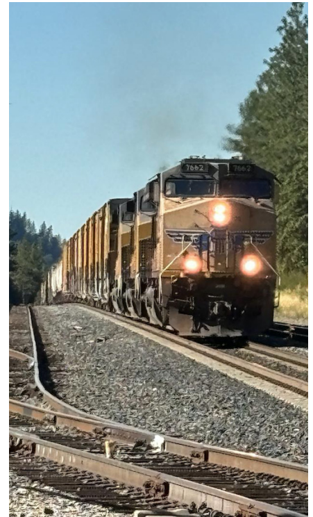
Above - An East bound Union Pacific freight.