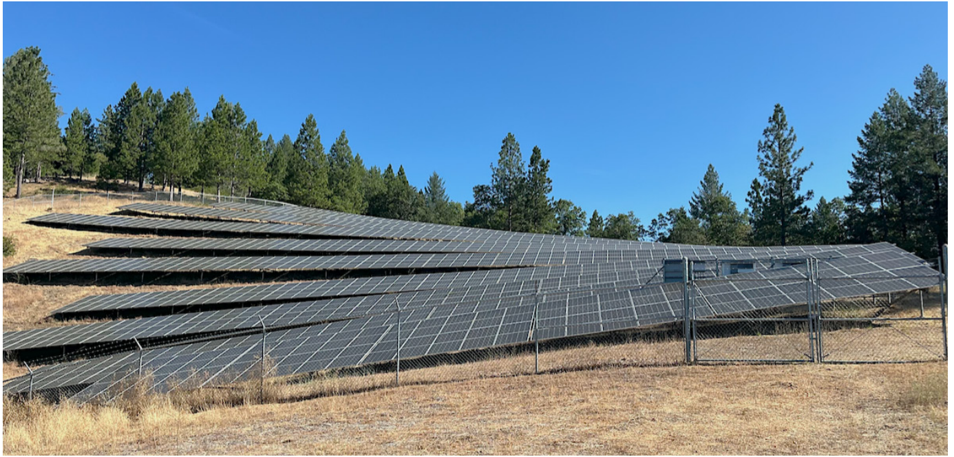
Waste Water Treatment Plant solar power array project completed.