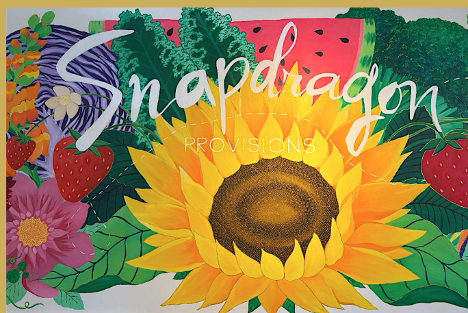
Stunning, full-sized wall mural inside the store.

Of course, I am talking about Snapdragon Provisions , the vegan and more cafe. All the same items for sale. All the yummy coffee and tea and chai hot or iced drinks. My favorite is the Signature Latte (Espresso, White mocha, Pistachio milk, Macadamia syrup). All the same breakfast