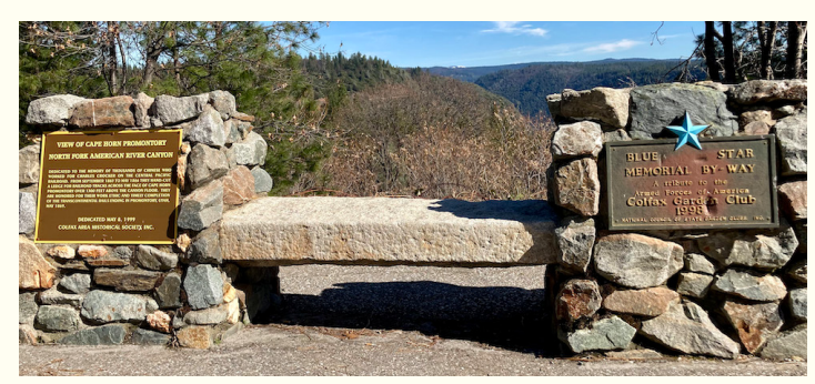
Walking tour ends here. Drive about a mile to see the Cape Horn Marker and enjoy the view across the canyon.

20. Cape Horn & Blue Star Highway Marker (CA HWY-174, Red Frog Parking Lot, Colfax, CA) The Capehorn Overlook has a bench provided by Colfax Area Historical Society with plaques commemorating Cape Horn, the Central Pacific Railroad construction, and the Blue Star By-Way. "This marker is dedicated to the memory of thousands of Chinese who worked for Charles Crocker on the Central Pacific Railroad. They were lowered over the face of Cape Horn Promontory in wicker Bosun's chairs to a point 1332 feet above the canyon floor. The ledge created for the railbed was completed May 1866."—HMDB.org