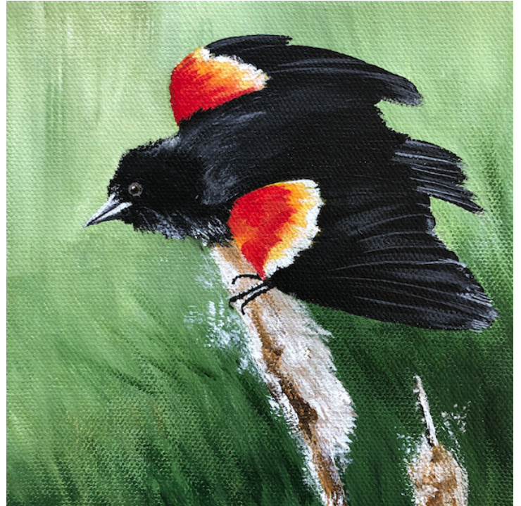
More of Cat Raymond's Art