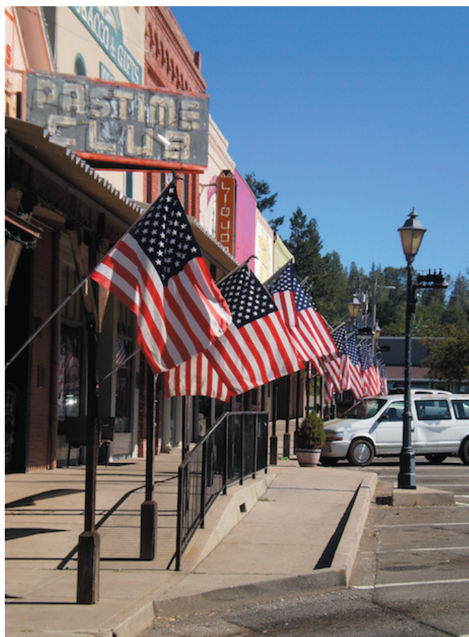
A quiet Memorial Day morning in Colfax with flags fluttering in a light breeze. More photos page 8.