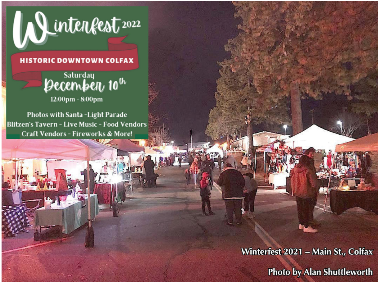
Winterfest 2021 – Main St., Colfax