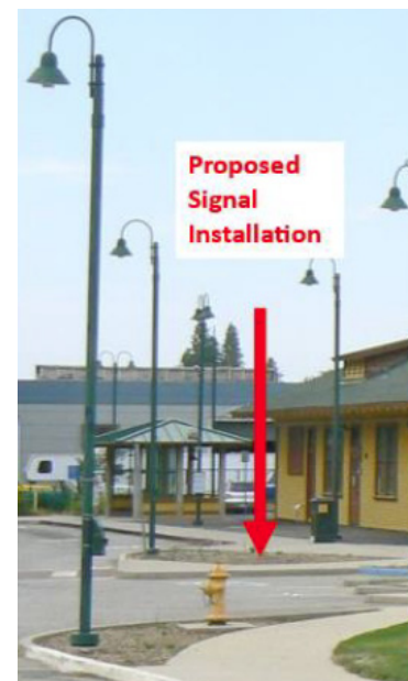
Top - Proposed location for the signal display.